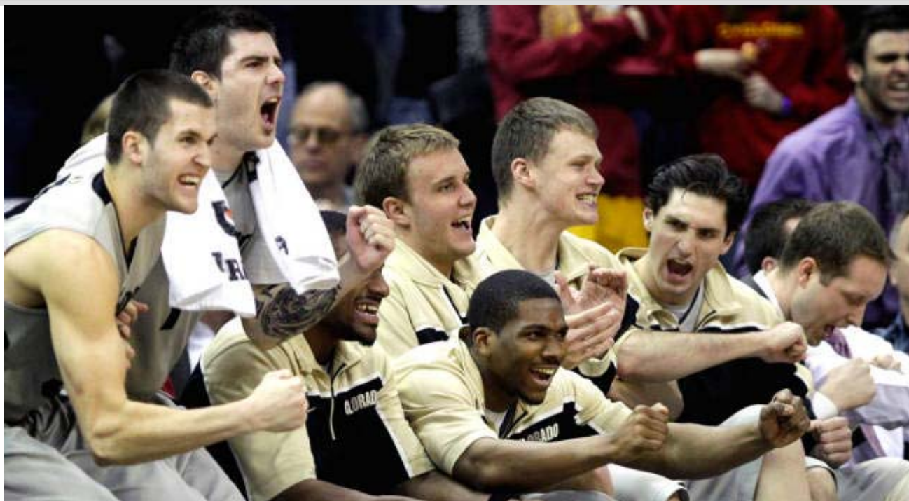
CU's bench comes to life in the final seconds of Wednesday's win over Iowa State.